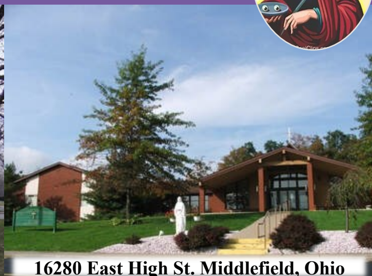
16280 East High St. Middlefield, Ohio